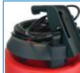
Ergonomic handle and cable strain relief