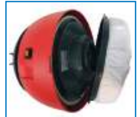
Motor head with filter basket complete