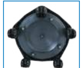
5 castor for stability and manoeuvrability