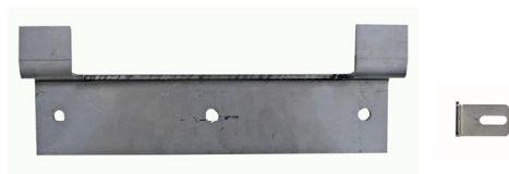
S/s mounting bracket Code 33804+ Code 33012 (Only for wall mounted version)