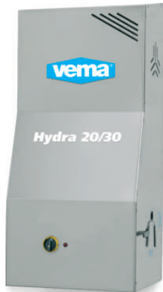
Wall mounted version Code 1065