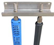
S/s wall holder for 2 lances Code 20904 (Only for wall mounted version)