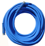
Bluflood. hose L= 20mt. S/s Crimped 1/2" female Code 18262/FFX/20000