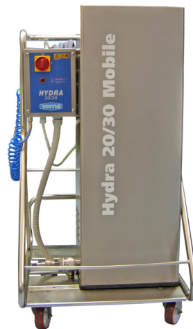
Mobile versions Code 1067/R Code 1067/CR