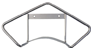
S/s wall holder for hose Code 20903