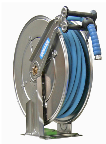
S/s automatic hose reel (Without hose) Code 10500 (Section 50)