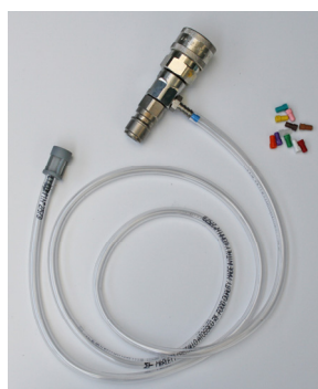
S/s injector for disinfection Code 21318/S