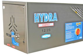
Wall mounted version