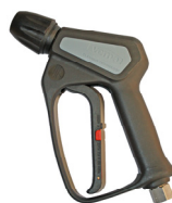
Gun with pin Ø 14 Code 25095/ST