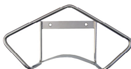
S/s wall holder for hose Code 20903