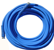
H.p. hose. R/2 L= 15mt. Crimped 3/8" female zinc. Code 18215