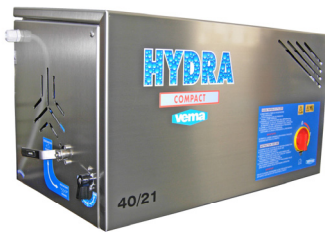
Wall mounted version