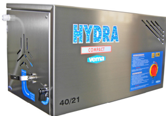
Wall mounted version