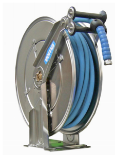
S/s automatic hose reel (Without hose) Code 10300 (Section 50)